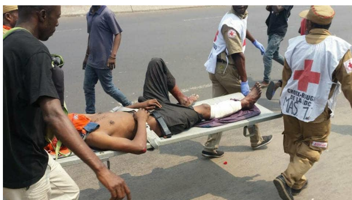
Wounded evacuated by RCDRC volunteers during a day electoral process

This high level of acceptance, professionalism and, in general, of access of RCDRC to transport wounded and killed in urban areas to nearest health centers during mass public mobilization or protest is the result of years of preparedness and experience of interventions including integration of Safer Access elements into RCDRC trainings, deployment mechanisms or communication strategies. More importantly, it involves protection and identification material for volunteers, creation of health posts in sensitive areas, external communication, positioning of RCDRC towards external actors, training of volunteers on safety, simulation exercises, etc. As the RCDRC President states: “all preparedness measures integrate SAF elements and are based on an evaluation process of the NS response to previous situations of violence”.