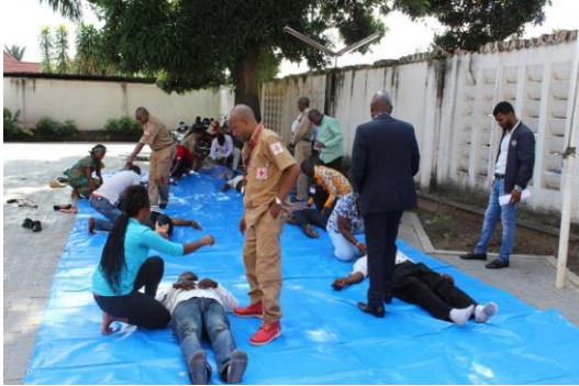
First Aid session to youth representatives of one of the main political party in November 2018.

These sessions of 2-3 days each one were really appreciated by the participants who have increased their knowledge in basic First Aid and learnt more about the mandate of the RCDRC. The map of health posts in Kinshasa was distributed to the participants. This map, which includes emergency phone numbers, was also shared with general public. As a participant suggested: “you should continue to disseminate the importance of having a contingency plan since it can save lives of people during days of mobilization and protest” .